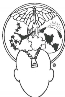
Logo circa 1995